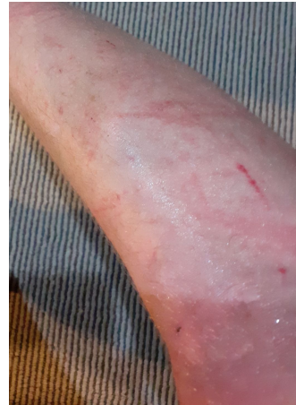
Ouch! Damage from looking for the top 25 traps

Our first exploration with Janette was informative and less painful!